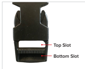
Top / Bottom Slots