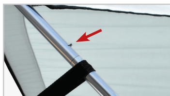
Internal Spring Button Stops Installed for Easy Break Down