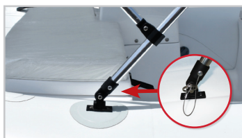
Stainless Steel Quick Release Pins for Easy Installation & Removal