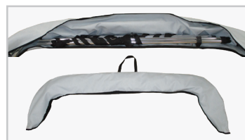
Storage Boot with Carrying Handle Allows You to Easily Take it On the Go

More Information at CarverCovers.com or call (888) 48-COVER.