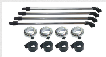
Optional Brace Kit