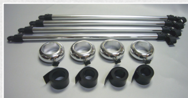
Optional Brace Kit