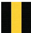
Jet Black & Sunflower Yellow (229)