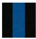
Jet Black & Pacific Blue (24)