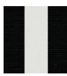
Jet Black & (240)