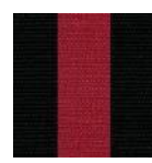
Jet Black & Natural Jockey Red (27)

Other color combinations available by special order